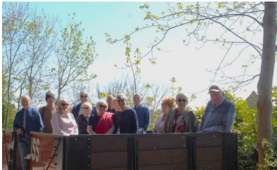
Exploring Towns and Villages: Train that goes nowhere