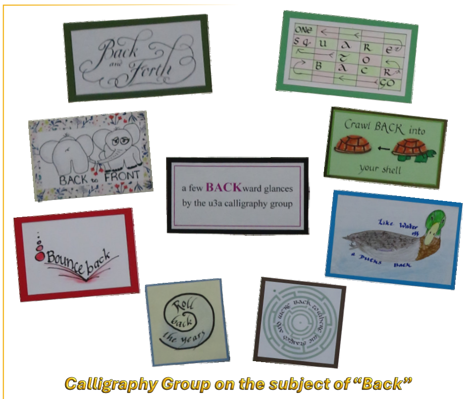
Calligraphy Group on the subject of "Back"

By post: Request a membership form to be sent by post from the Membership Secretary (details on last page).