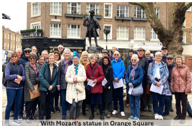
With Mozart's statue in Orange Square

In March Hilary led us in and around fashionable and affluent Belgravia, known for its grand stucco houses, upscale boutiques, and garden squares, conceived and built by the Grosvenor family who still own large areas of London including the former site of the USA embassy. Apparently in the 1950s the US government asked if they could purchase the freehold of the Square from the Grosvenor family whose trustees “indicated that it would be possible to buy the freehold on one condition; namely that the lands confiscated at the end of the American War of Independence be returned to the Grosvenor family. The Ambassador decided not to push ahead with buying the freehold”.