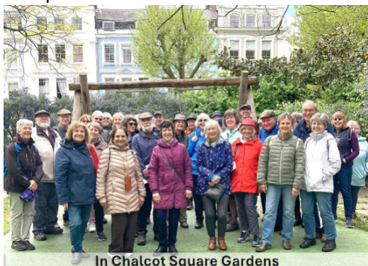
In Chalcot Square Gardens