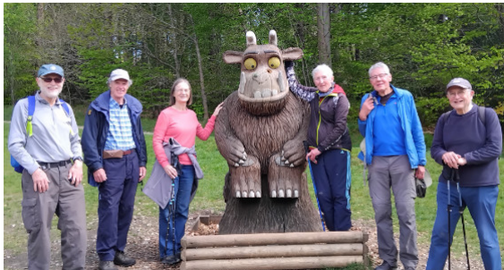
Walking Group with the Gruffalo in Wendover Woods