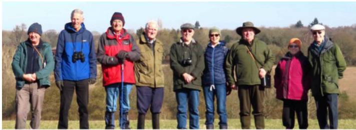
Nature Study at Studham Common where they spotted a Muntjack deer