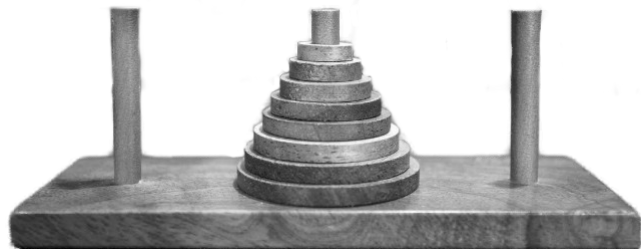
Tower of Hanoi