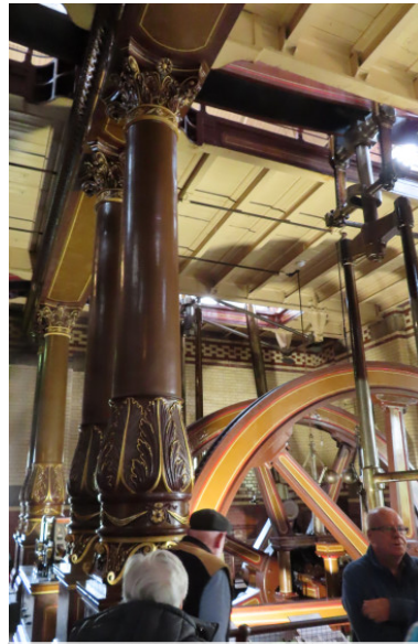
Industrial History admiring the Victorian Abbey Pumping Station