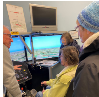
Bus Trippers flying at the Trenchard Museum