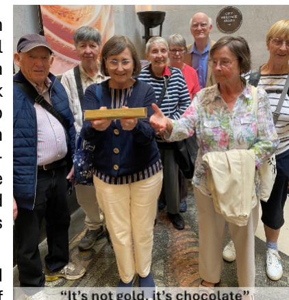
“It's not gold, it's chocolate”

Our trip to the Bank of England Museum began with a train into Euston then a 205 to the Angel Islington and a 43 to Gracechurch Street for a break in The Cross Keys (a beautiful old bank refurbished by Wetherspoons). We walked up to Threadneedle Street and into the museum where we found exhibition of hats and hat making as well as the history of the bank. Of course we all tried to lift the gold bar and concluded that even if we could remove it from the glass case it was too heavy to carry home.