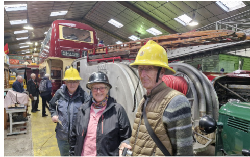
Industrial History: Abbey Pumping Station Transport Museum