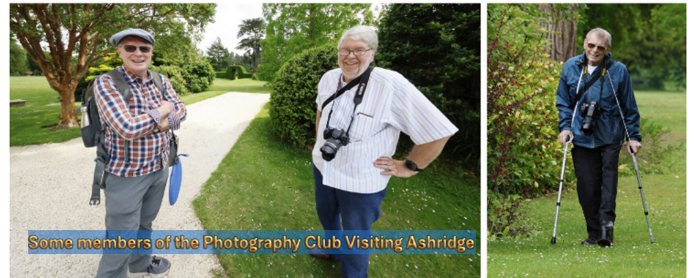
Some members of the Photography Club Visiting Ashridge