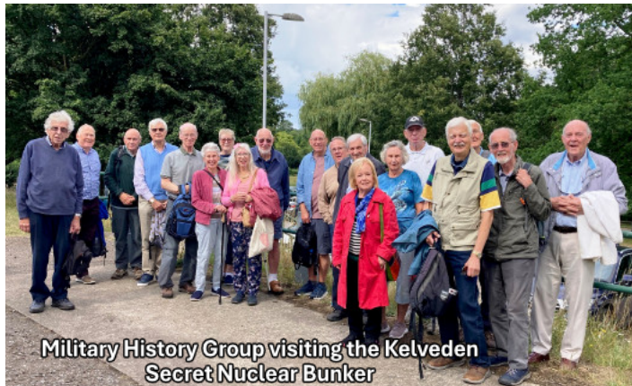
Military History Group visiting the Kelvedon Secret Nuclear Bunker