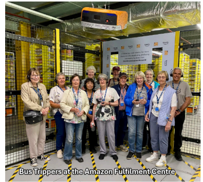
Bus Trippers at the Amazon Fulfilment Centre