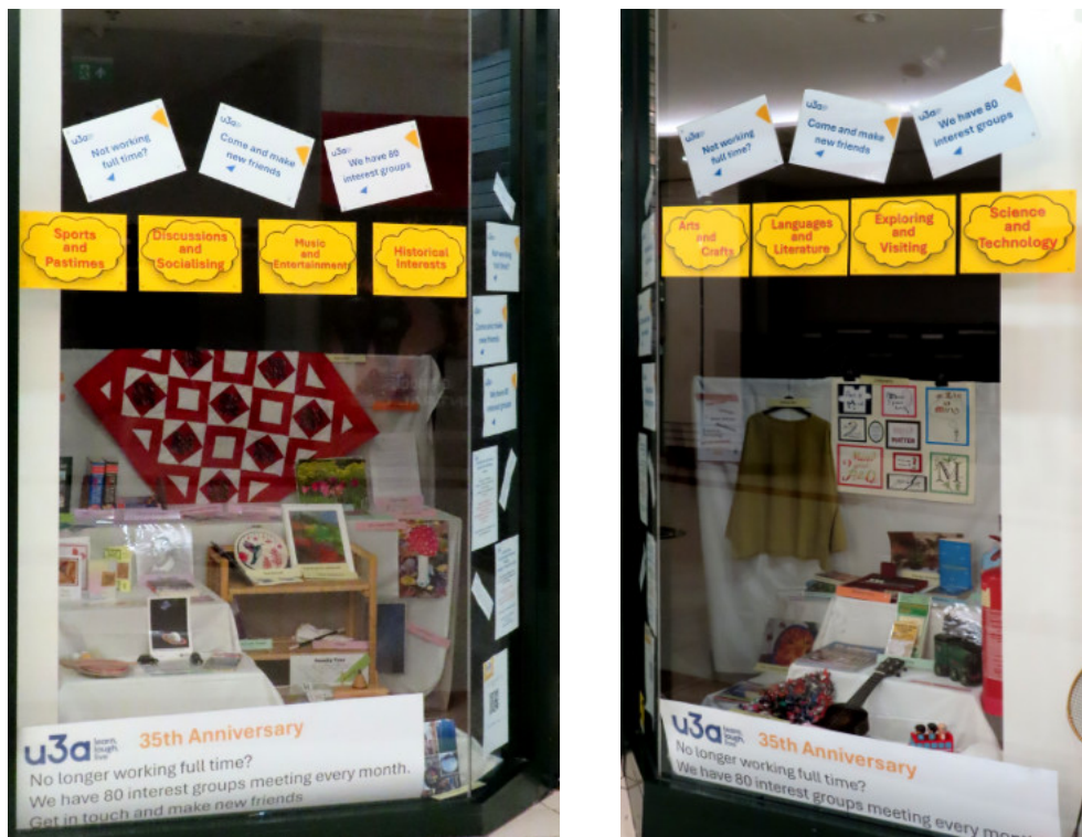
Our Displays in a Marlowes shop window

By post: Request a membership form to be sent by post from the Membership Secretary (details on last page).