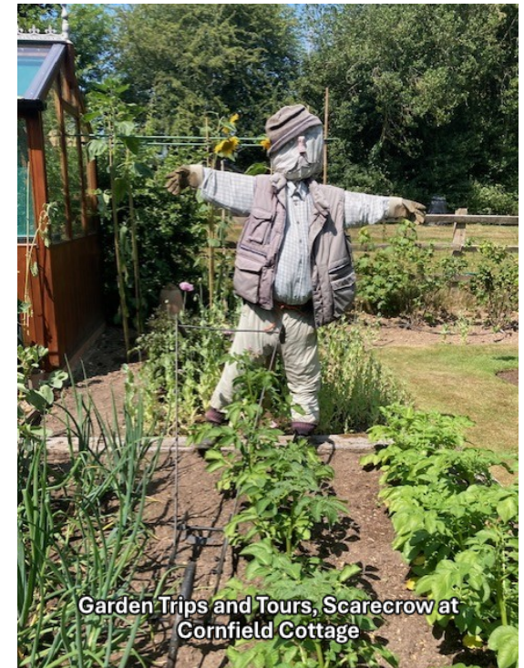
Garden Trips and Tours, Scarecrow at Cornfield Cottage