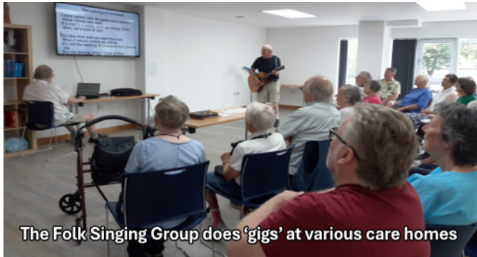
The Folk Singing Group does 'gigs' at various care homes