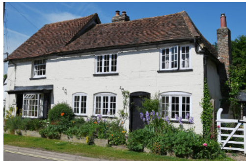
Lace Cottage, Home of Louis MacNeice

Over recent months the group has been exploring the history of Aldbury and Ashridge. Several of the houses in the village date back to around 1500. The village has strong literary connections, with Mrs Humphry Ward, at one time living in Stocks House and for the last few years of his life, Louis MacNeice residing at Lace Cottage.