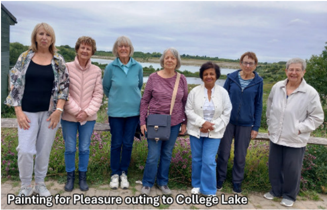
Painting for Pleasure outing to College Lake